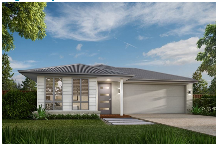
🔄 4 Bed, 🚍 2 Bath, 🚊 2 Garage, House & Land