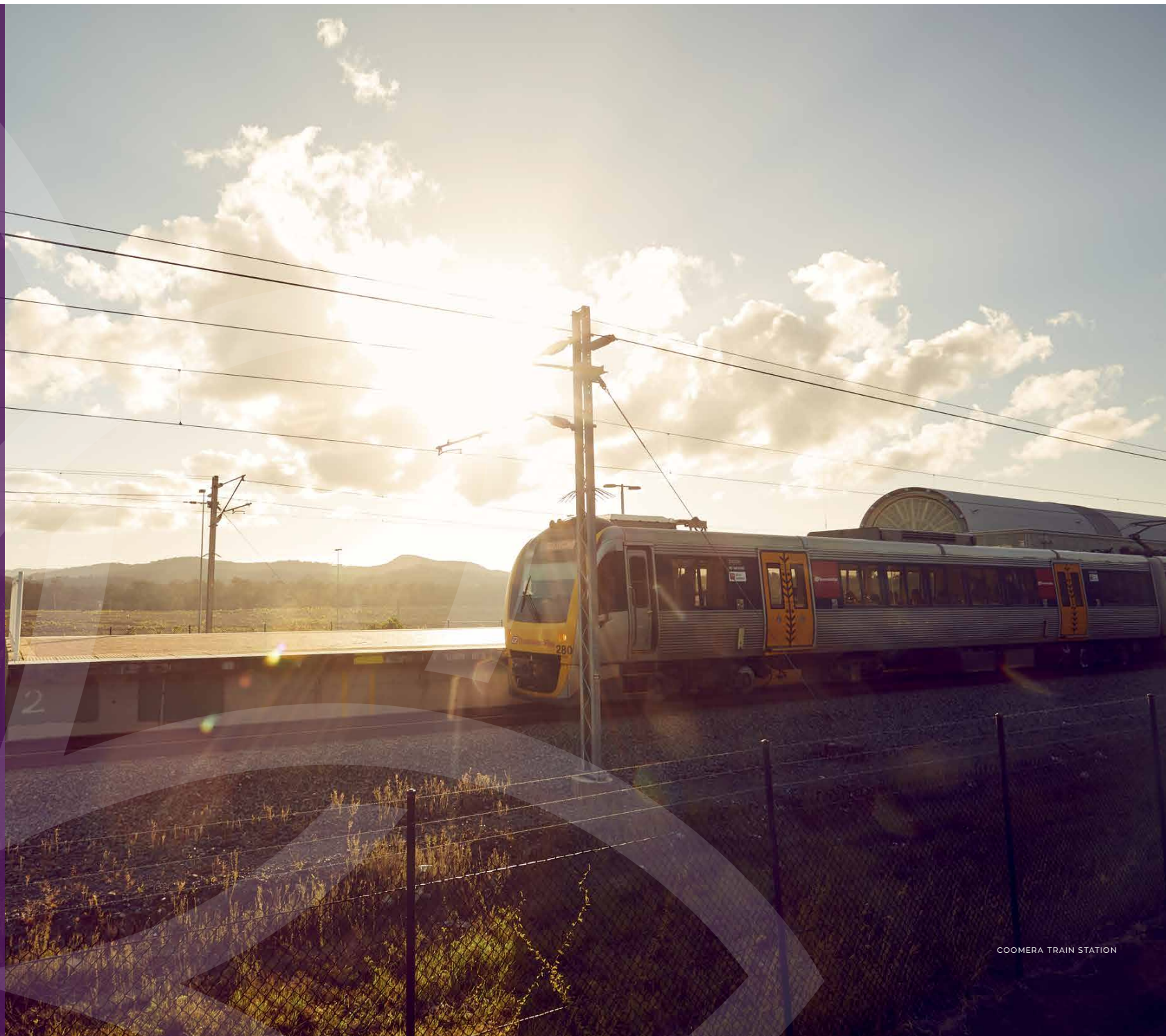
COOMERA TRAIN STATION

Coomera is well on the way to becoming a self-sufficient regional centre, with excellent public transport links, education, retail, recreation and employment opportunities.