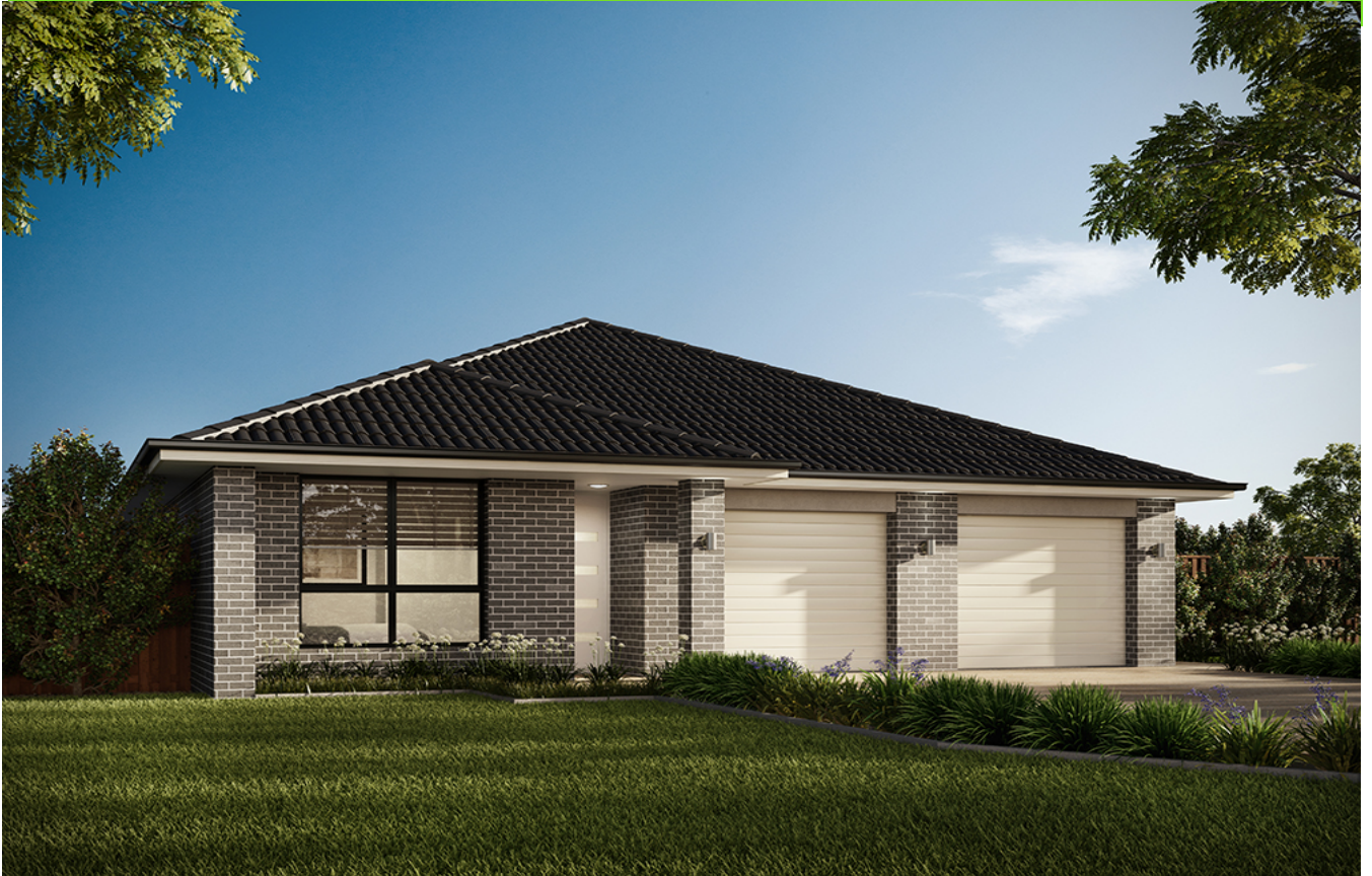
“Sanctuary Estate” Fletcher NSW