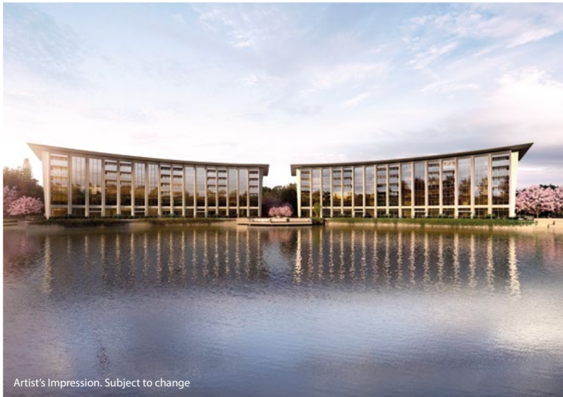
Artist's Impression. Subject to change

Inspired by the ceremonial beauty of classic architecture, the two gracefully tapered towers present 110 superbly appointed two and three bedroom apartments and penthouses, spread across six levels. Refined comfort is the hallmark of these luxurious living environments. Open plan design, high ceilings and floor to ceiling windows give access to glorious views, while well-considered lighting and superior fittings and finishes complete the picture of paramount luxury. Vibrant new café, retail and leisure precincts are located at marina level, enhanced by impeccable landscaped gardens.