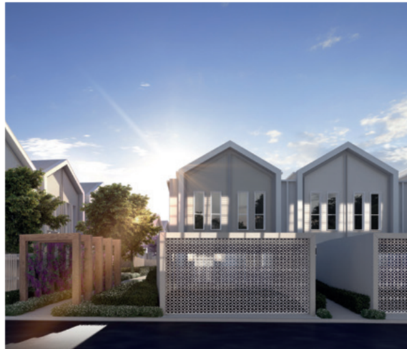
ARTIST IMPRESSION - INDICATIVE ONLY