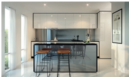
ARTIST IMPRESSION - INDICATIVE ONLY

Each home presents a contemporary design featuring living, dining and entertaining spaces, three bedrooms, bathroom, master ensuite and powder room. Manicured garden settings frame the views from the kitchen, which feature quality reconstituted stone bench tops, high-gloss cabinetry with ample storage and stainless-steel appliances.