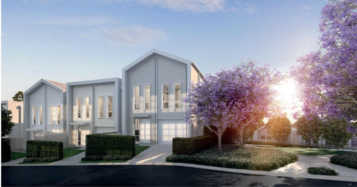
ARTIST IMPRESSION - INDICATIVE ONLY

SUNLAND GROUP IS PROUD TO PRESENT THE HILLS RESIDENCES – A COLLECTION OF CONTEMPORARY FAMILY TERRACE HOMES, SUPERBLY LOCATED IN THE HEART OF EVERTON HILLS.