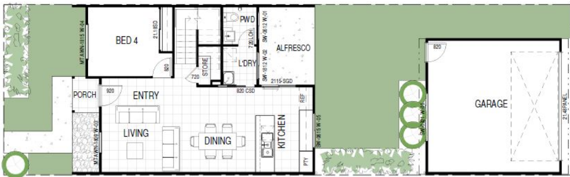
2 GROUND FLOOR PLAN 1:100